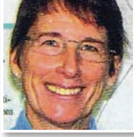
Diana Richardson Preschool & Kindergarten, Chesterton Montessori School, Chesterton